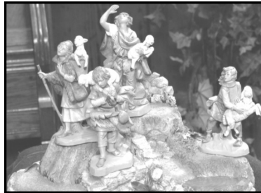
Fontanini's "Shepherds on the Mountain"

Syvertson's impressive collection may be viewed at the Heritage Center between